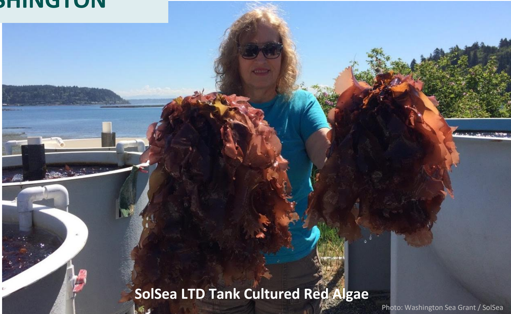
SolSea LTD Tank Cultured Red Algae