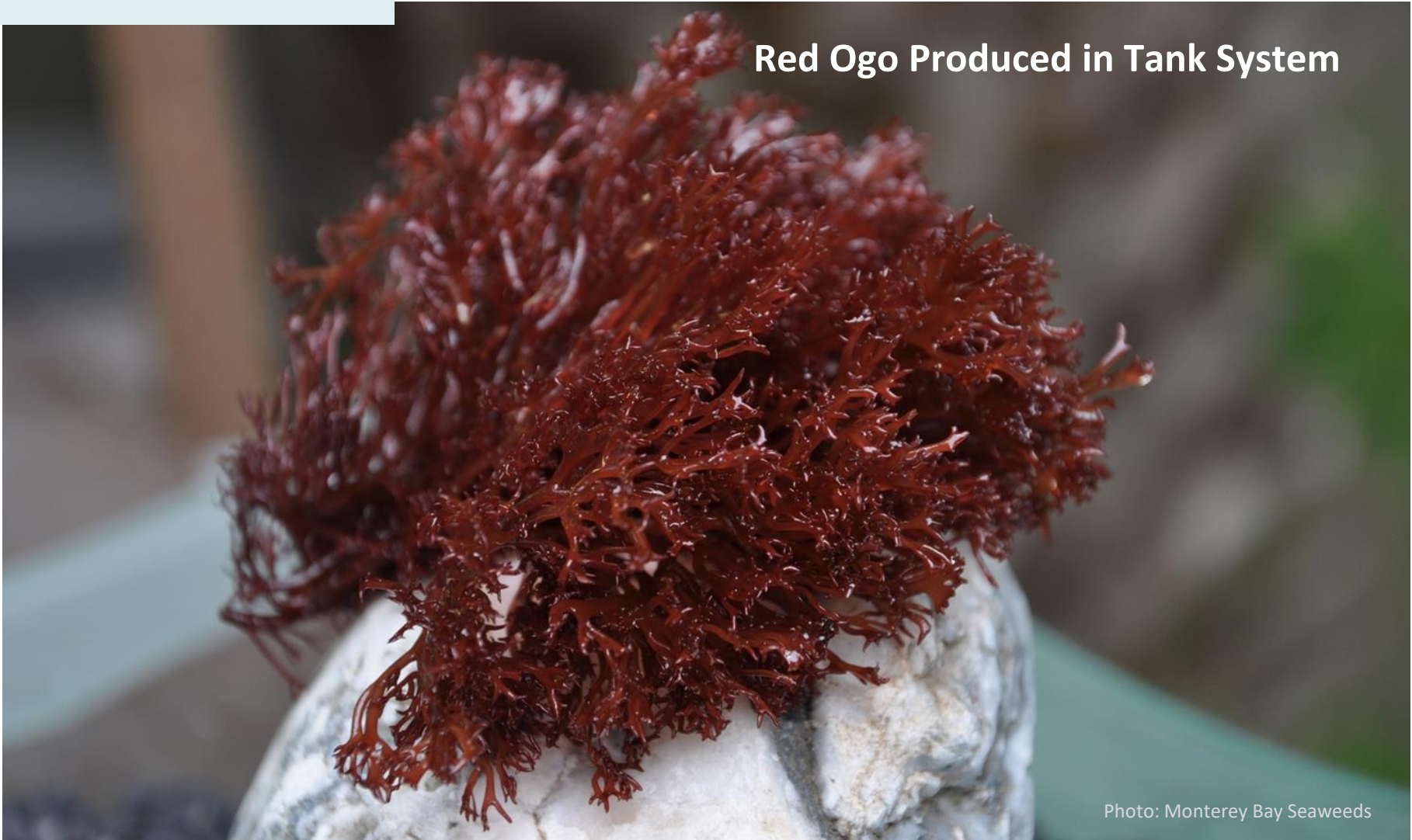
Red Ogo Produced in Tank System