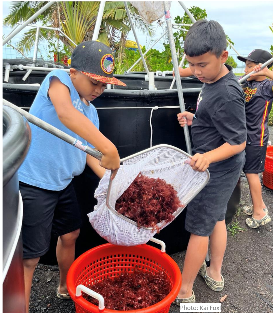
Tank Culture System