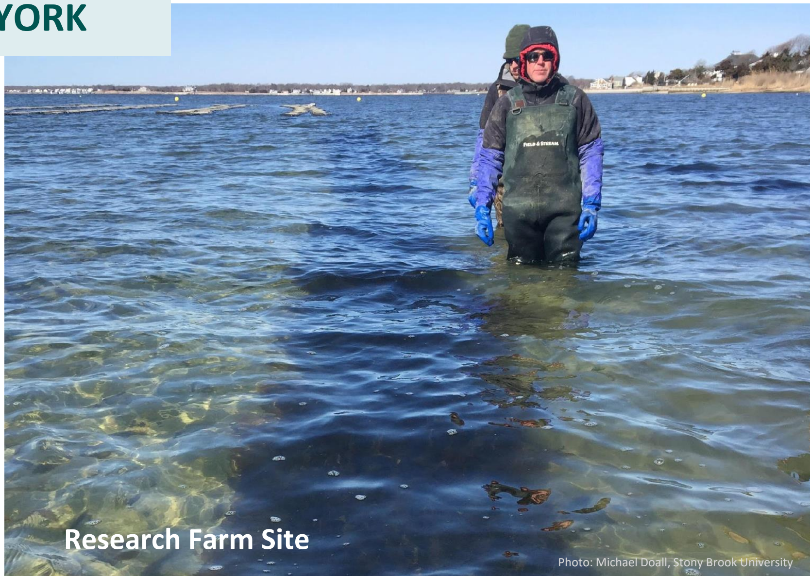
Research Farm Site